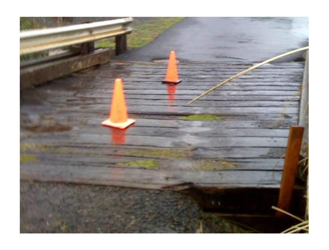
Asbury Creek Bridge